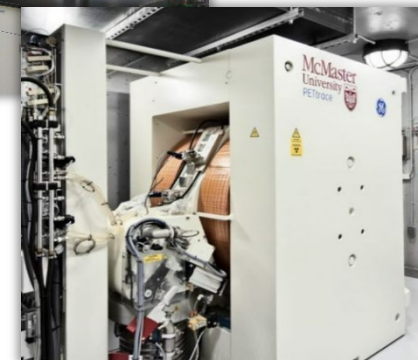
McMaster University Cyclotron Facility

McMaster is home to several facilities that provide experiential learning for the nuclear industry.