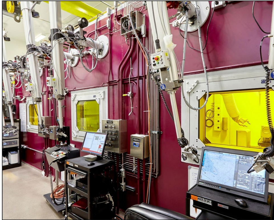
Centre for Advanced Nuclear Systems

Staffed, managed and operated by Nuclear Operations and Facilities (NOF)