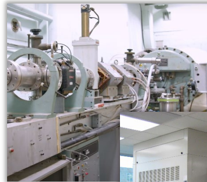
McMaster Accelerator Laboratory