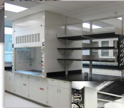
High Level Laboratory Facility